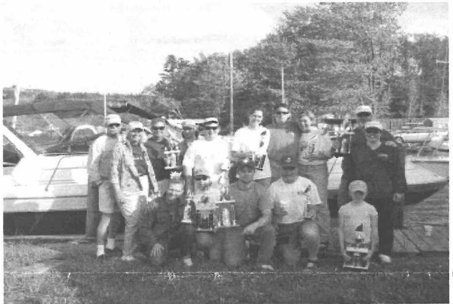
25th Annual Michelob Cup Winners